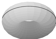
Figure 1: Staying on the outside of the doughnut.

The first ant, Grant, suggests that the shortest route would be to follow the path of (3, 0, 0) as it rotates about the z -axis as in Figure 1 Antonio, the second